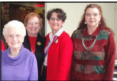
Some of the many volunteers who helped with gift wrapping on December 11, 2010.

December is a busy time for all of us: special holiday celebrations, getting together with friends and family and all